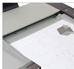
Support your documents with paper feed guides