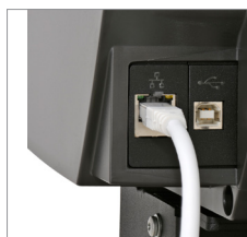
Fastest bandwidth in the industry w/ Gb Ethernet and xDTR2