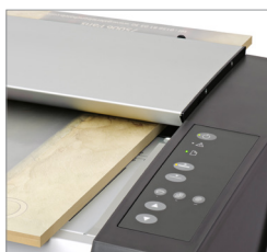
Scan thick originals with automatic thickness control (ATA)