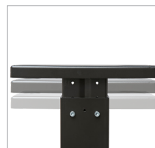
Height adjustable stand for optimal ergonomics