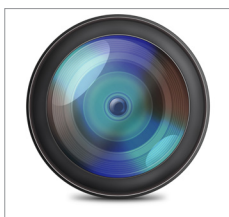
Contex CCD with ALE ensures precision of 0.1% accuracy

HD Ultra scanners are for customers who require a high throughput of documents, great flexibility and unmatched performance.