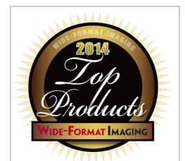
Contex HD Ultra awarded Best Wide Format Scanner