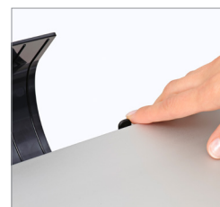
Easily adjust paper pressure to protect fragile documents